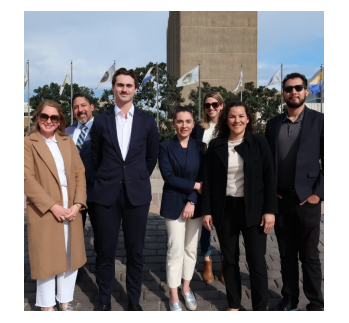
(Chapman University Student Team)