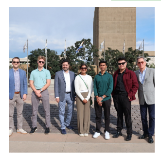
(UCI Student Team)

About NAIOP SoCal: With over 1,300 members, NAIOP SoCal is the leading association representing commercial real estate in Southern California. Our mission is to provide advocacy, education, and networking opportunities that support the industry's growth and success. With a focus on innovation and leadership, NAIOP SoCal is dedicated to shaping the future of commercial real estate in the region. Learn more at <u>www.naiopsocal.org</u>.