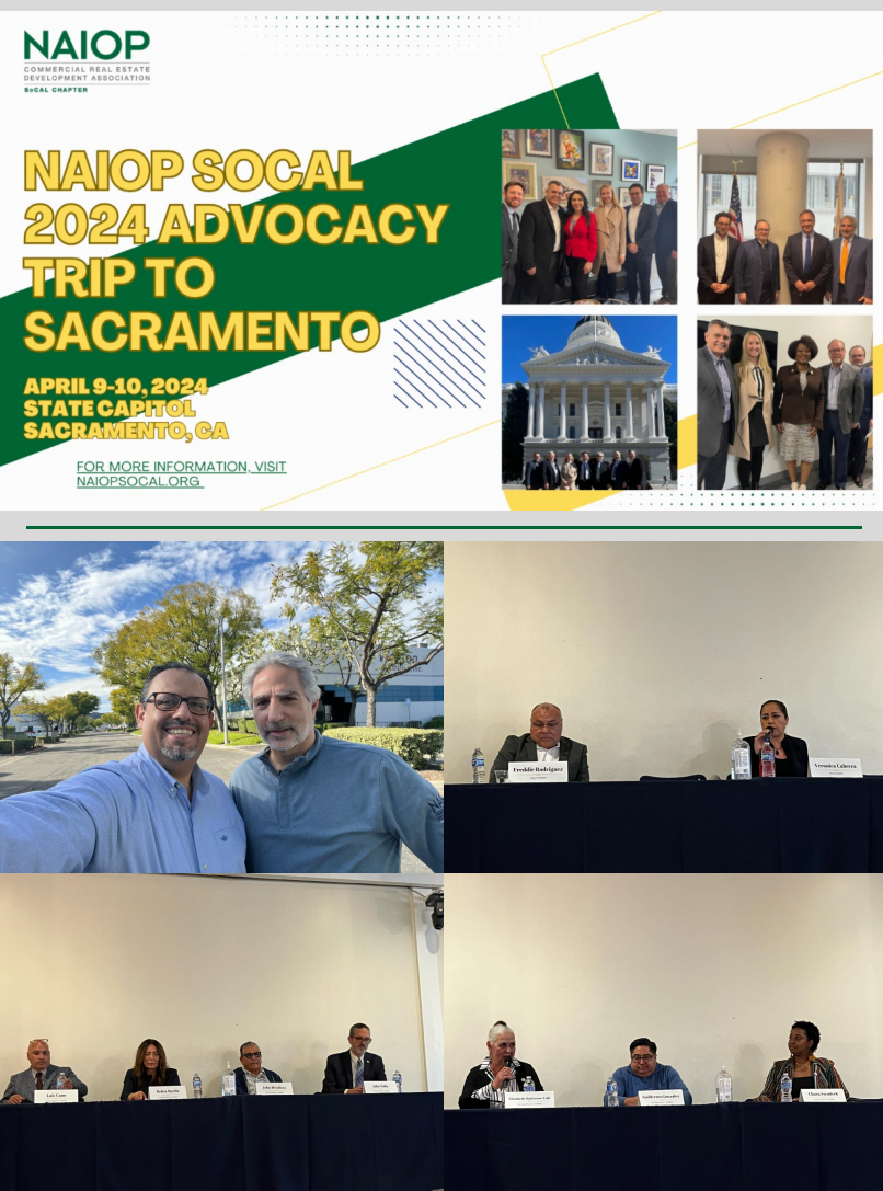
NAIOP SoCal Staff Visit Industrial Sites in Pomona

We look forward to advocating with you during our Annual Advocacy Trip to Sacramento from April 9-10, 2024.