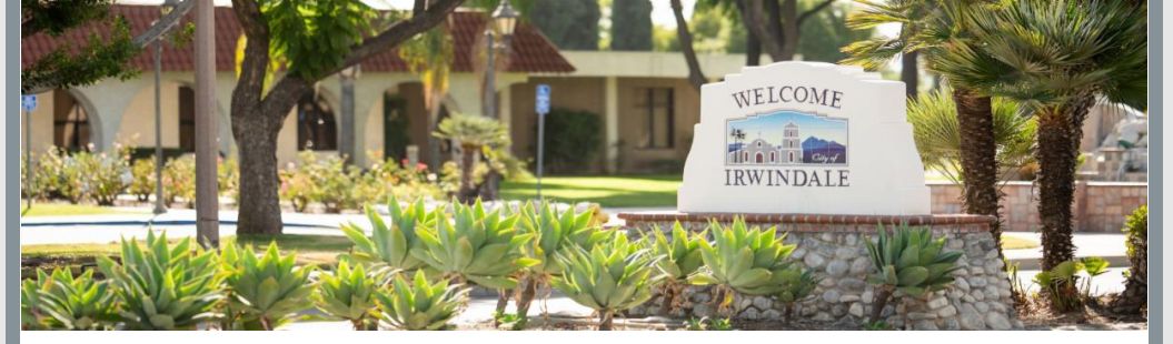
Mini Victory for NAIOP SoCal and Its Members in the City of Irwindale

After months of ardent and consistent advocacy since the summer of 2024 on the City of Irwindale's draft Zoning Code Update, NAIOP SoCal and our Members secured a mini victory during the February 19, 2025 Irwindale Planning Commission hearing on the update. Kudos to NAIOP SoCal Members and long-term, institutional stakeholders in Irwindale for their effective advocacy over the past several months.