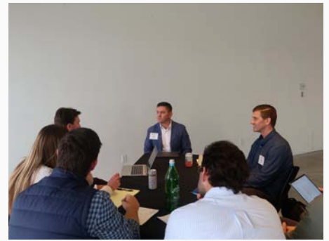
YPG team working on their Capstone Project