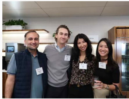
LA Alumni Sub Committee