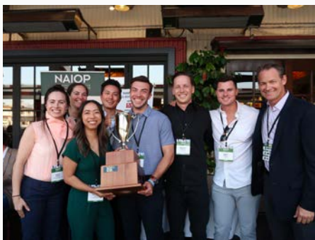
YPG 2023-2024 Case Competition Winners

The Young Professionals Group (YPG) is NAIOP SoCal's industry-leading professional development and leadership program. Each year, 35 real estate professionals are selected to take part in a 12-month, 70-hour course designed to educate, develop, connect and elevate the industry's emerging leaders. The program offers instruction on critical components of the industry, personal and professional development coaching from MBA-level instructors, extensive networking and relationship-building activities, and guidance from executives through an intimate speaker series.